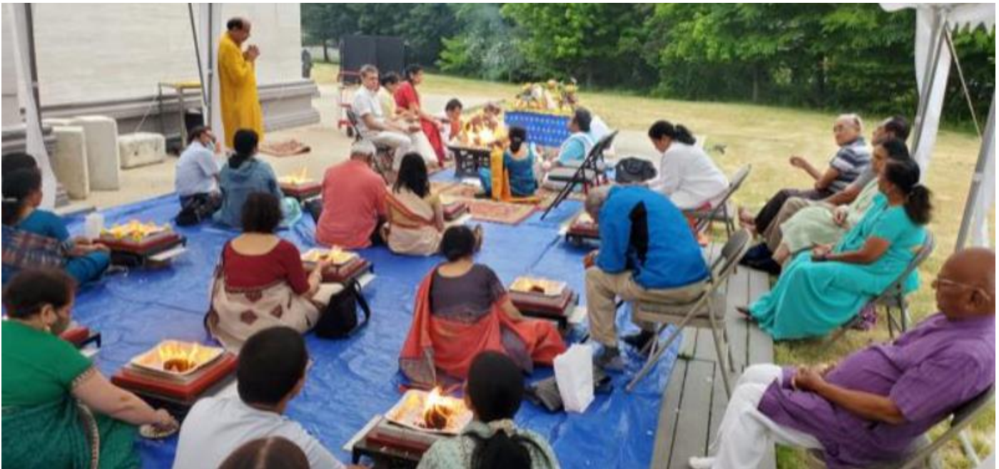
Photo From Varshik Brahmotsav Havan