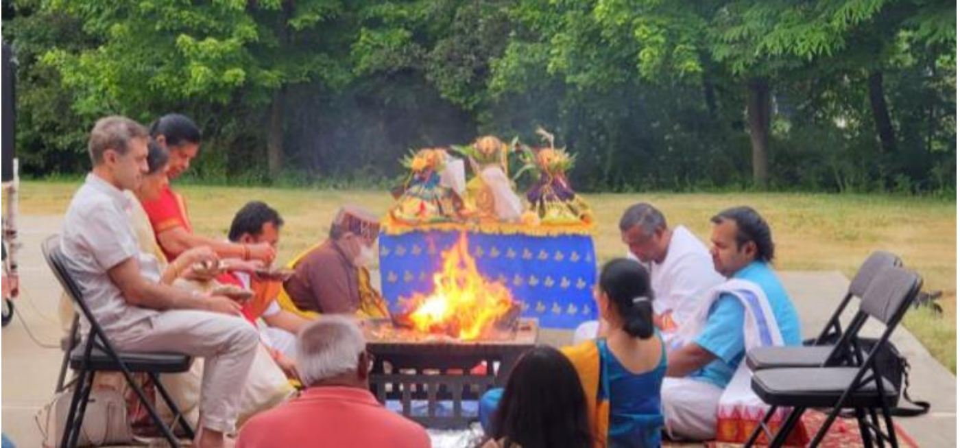
Photo From Varshik Brahmotsav Havan