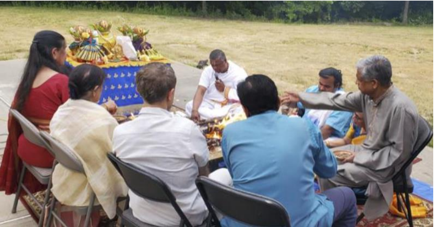
Photo From Varshik Brahmotsav Havan

All the celebrations were ended on June 4th in a grand scale, more than 300 Bangladesh devotees came in buses to have Maha Prasad and dharshan. Amritvani bhajans filled the hall with devotional music. Maha Prasad was served on all days.