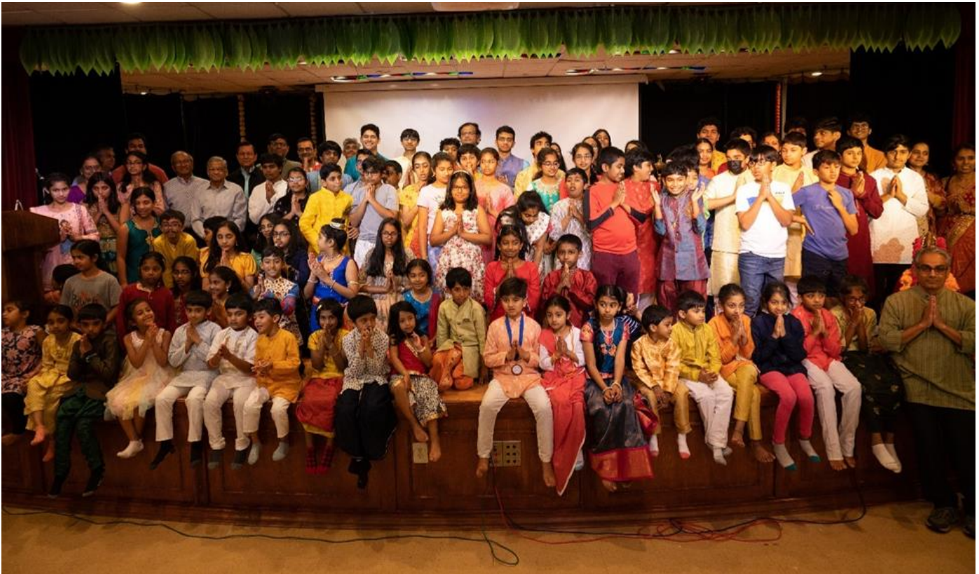
Bharatiya Vidyalaya students, volunteers and guests after performing in Religion Day program on Sunday, April 23 rd