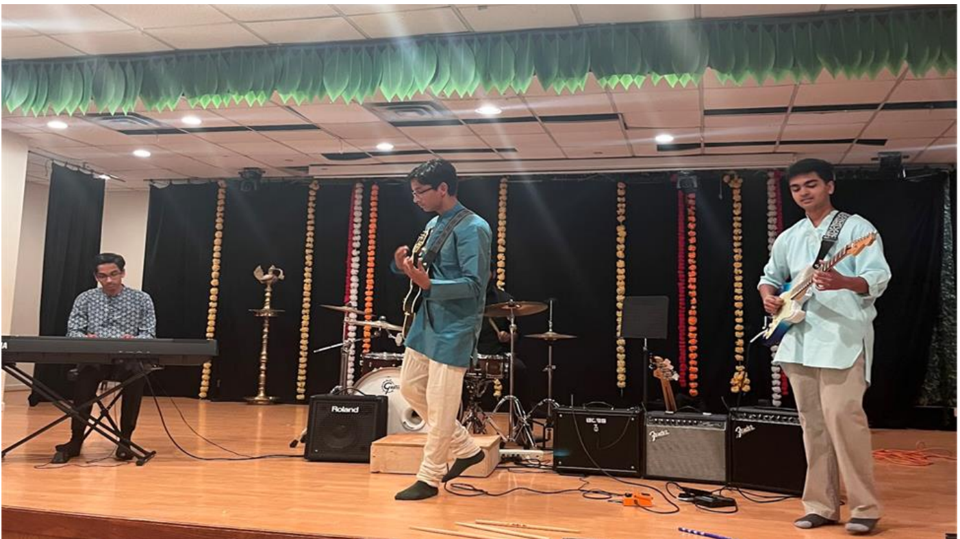
Highlight of Spring Garba was amazing performances from a youth band call INDIUM